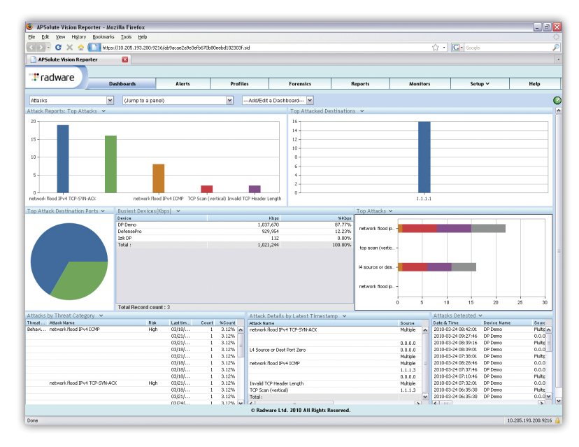
Figure 2 - The security dashoard displays multiple attack reports in a single view, customizable per user.

APSolute Vision allows users to fully customize real-time security dashboards and historical security reports. This ensures users can get a full network security view at a glance, with the exact information relevant to them and reduces the amount of drill downs required to reach information.